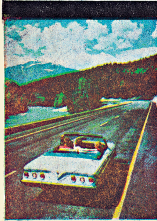
Opening this summer is the Rogers Pass section of Trans-Canada highway. It numbers among the world's most scenic drives.

GOVERNMENT OF BRITISH COLUMBIA DEPARTMENT OF HIGHWAYS