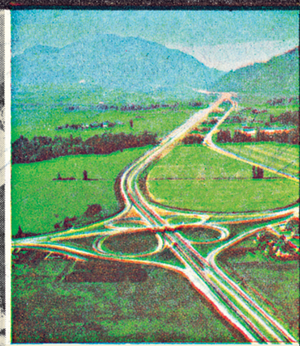
Cloverleaf near Chilliwack is typical of the fine new highways being constructed throughout British Columbia.